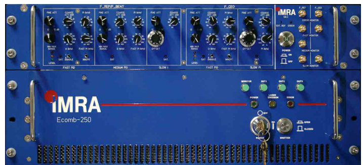
Front panel of ULC with E-comb 250R